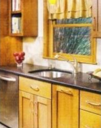
Crupi says that while granite is still the most popular choice for countertops, new textures, like this leathered Cambrian Black granite, are a hot new style. She adds that they're great for homes with kids as fingerprints and streaks don't show up quite as much.