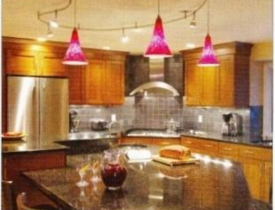
Combine the modern with the traditional for transitional style. The Shaker-style cabinet doors were updated with wider stiles and rails and stainless hardware instead of wood to create a look that gives "a nod to the simplicity of the past that speaks to today's cleaner aesthetic."